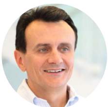
Pascal Soriot CEO AstraZeneca

It is critically important to us that the Third Parties we work with share our values and ensure that any work on our behalf upholds our ethical standards. Only together can we maintain and enhance the trust of our customers and stakeholders and, ultimately, deliver our purpose: to push the boundaries of science to deliver life-changing medicines.