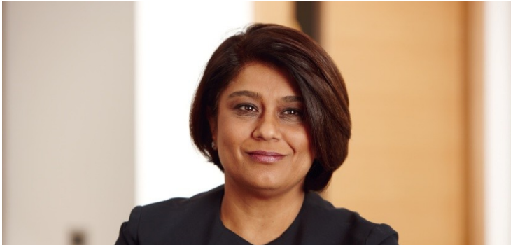
Shriti Vadera Non-Executive Director