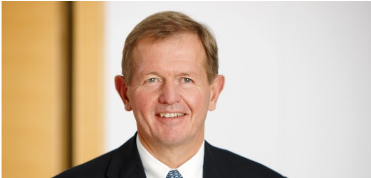
Marcus Wallenberg Non-Executive Director